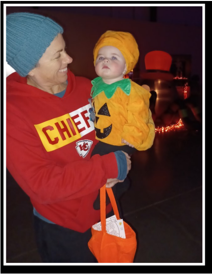
This wee pumpkin looks unsure of all the goings on, but bravely managed to get some treats.