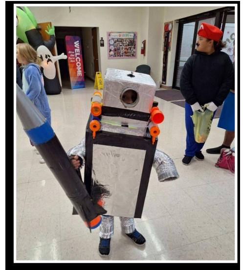
This little robot costume was made by the young man wearing it. Very creative!

Above, children and parents are lined up to enter the spooky Family Life Center to get some candy. We also had a Boo Basket raffle, which folks signed up to win. Many thanks to all the volunteers, candy donors and gift basket donors!