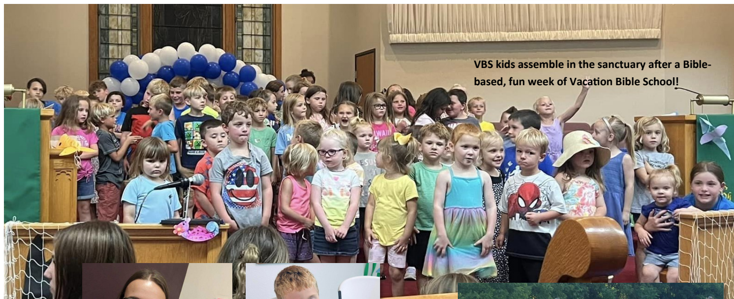
VBS kids assemble in the sanctuary after a Bible-based, fun week of Vacation Bible School!