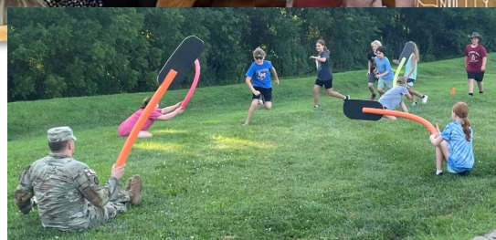
Fifth & Six graders enjoy some fun recreation outside.